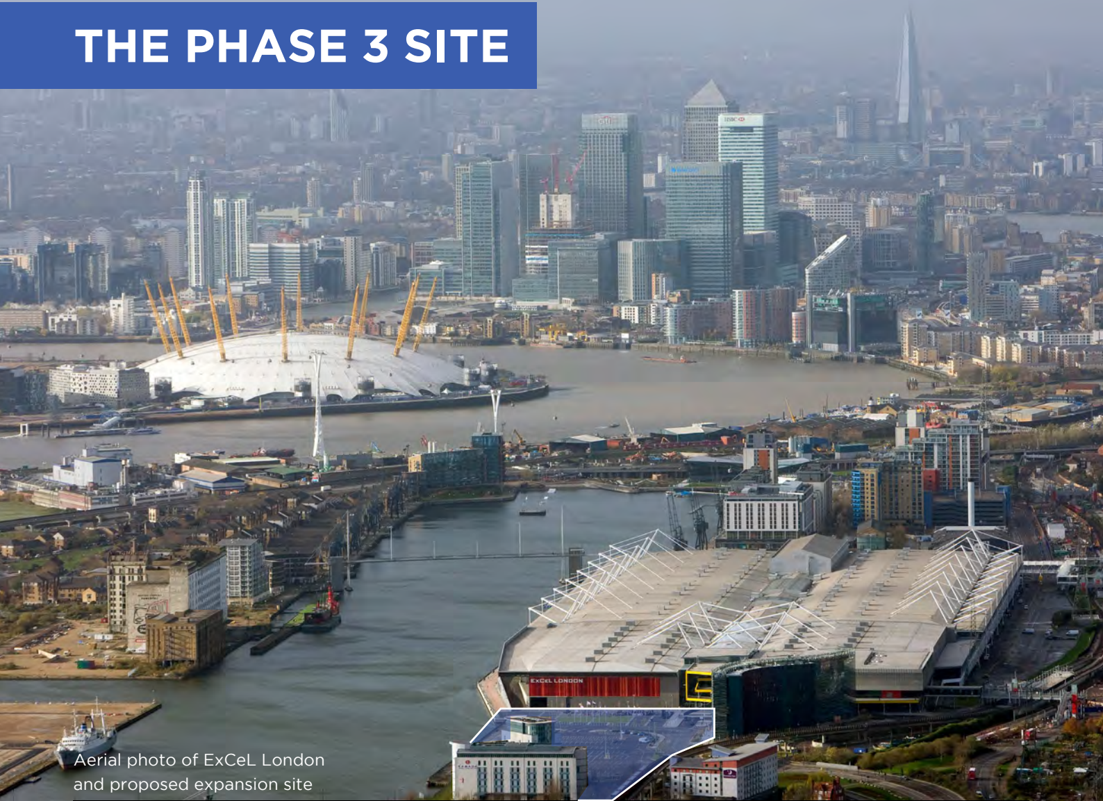
Aerial photo of ExCeL London and proposed expansion site

We're calling the expansion project Phase 3. The proposed site is located to the east of ExCeL London, adjacent to the Aloft Hotel. It is currently used for external event space and overflow car parking.