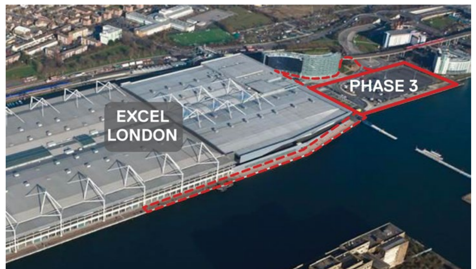
Additional areas added to the Phase 3 red line boundary to incorporate increased public realm improvements

Additional green space and new enhanced public realm along the north façade