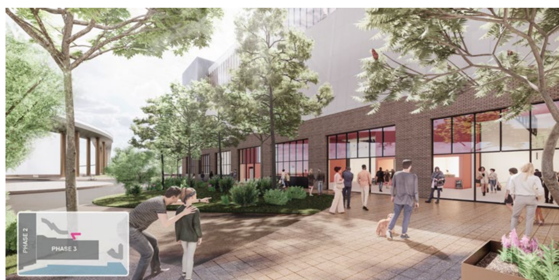
View looking east towards the northern facade and public realm

The improved connectivity between the DLR, ExCeL and the dock-edge will also allow us to provide new dedicated pedestrian and cycling connections, making the area more inviting for walkers, joggers and cyclists.